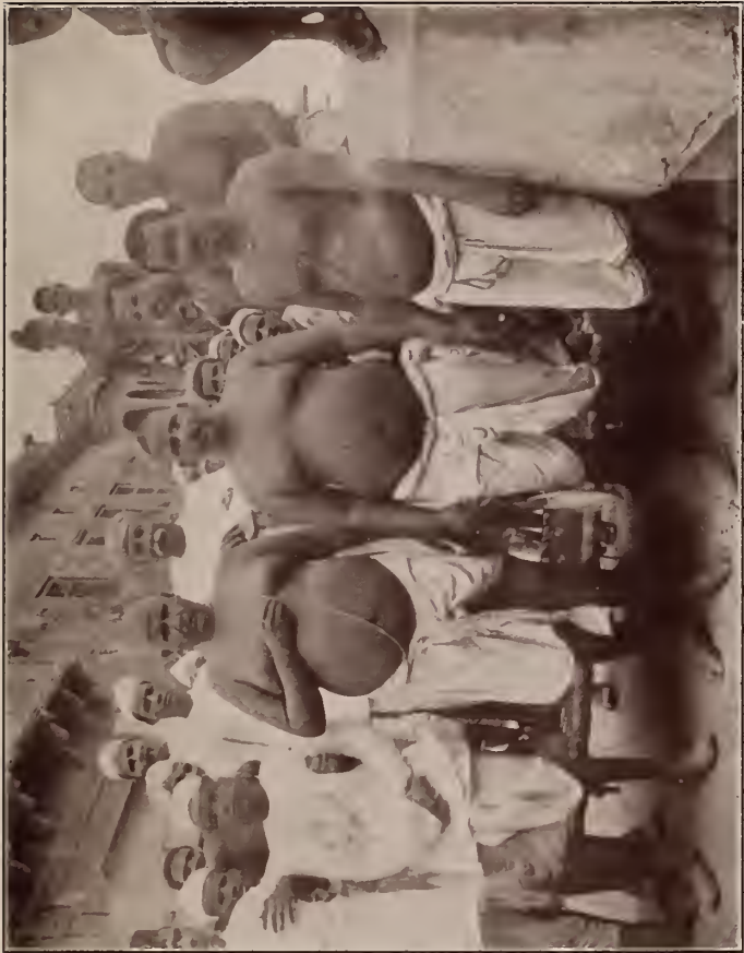
Brahmin priest at Brindaban, the shrine city where thousands of widows reside in temples.